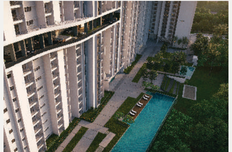
Rohan Upavan, Off Hennur Road, Bengaluru.