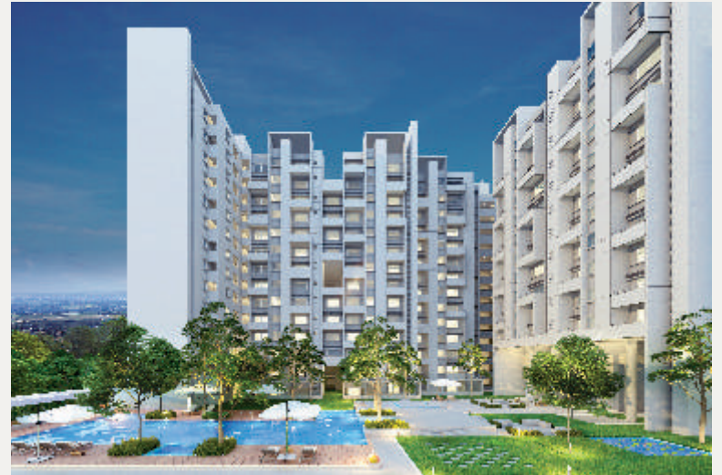
Rohan Madhuban-II, Bawdhan, Pune.