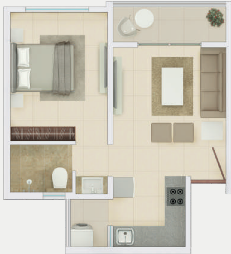
Typical 1 BHK