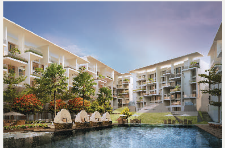
Rohan Kritika, Sinhad Road, Pune.