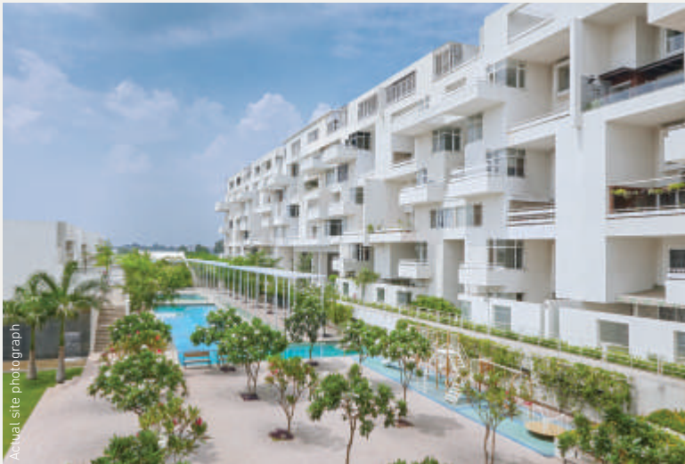
Rohan Mithila, Opp. Airport, Pune.