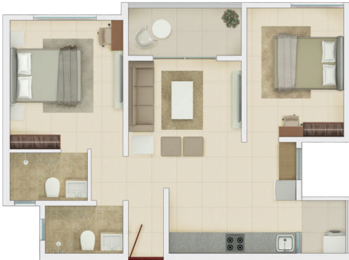
Typical 2 BHK