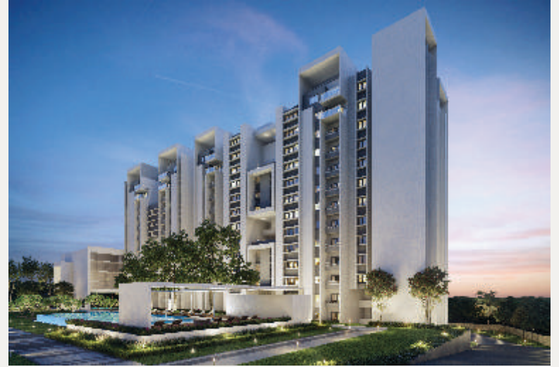
Rohan Akriti, 1 km off Kanakapura Road, Bengaluru.